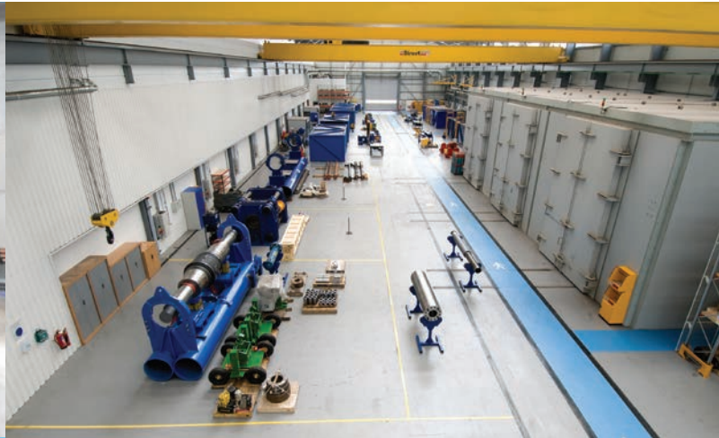
Heartlands Test Laboratory