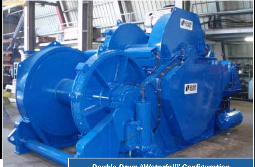
Double Drum "Waterfall" Configuration