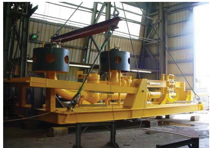
PLET ready for final inspection and load out