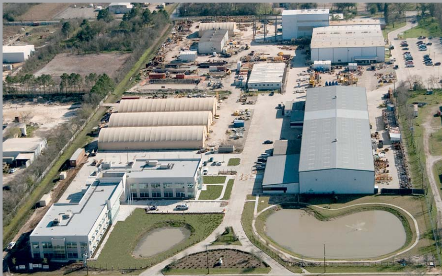
Houston Hobby Facility