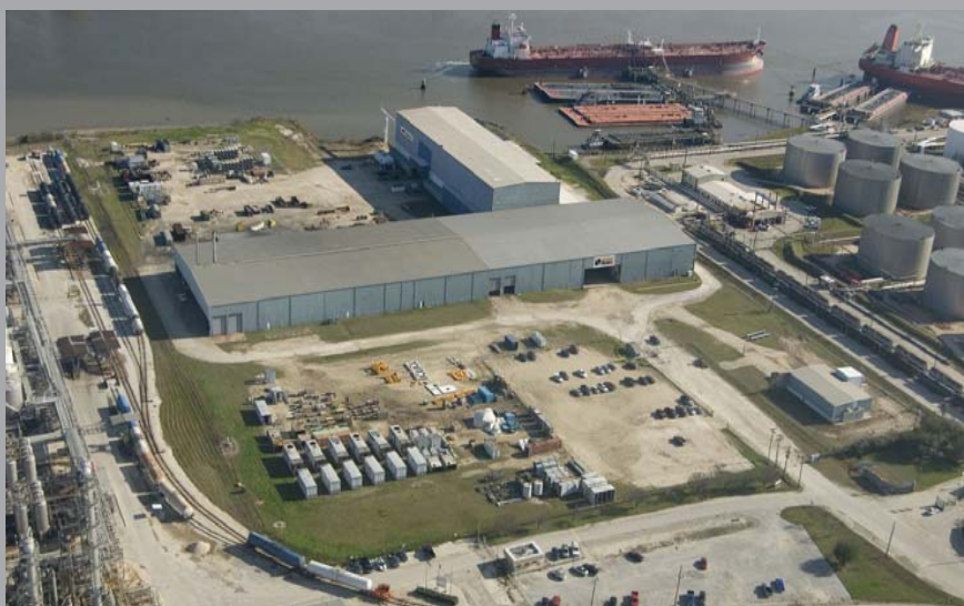
Houston Ship Channel Facility