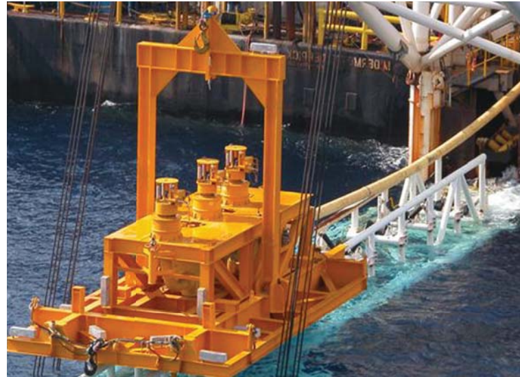
PLEM being deployed for service in the Gulf of Mexico