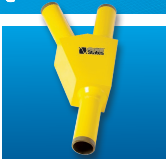
Piggable Wye: Asymmetrical Design

Oil States' Houston-based Subsea Pipeline Systems division designs, manufactures and markets proprietary deepwater and shallow water pipeline connectors for subsea pipeline construction, repair and expansion projects.