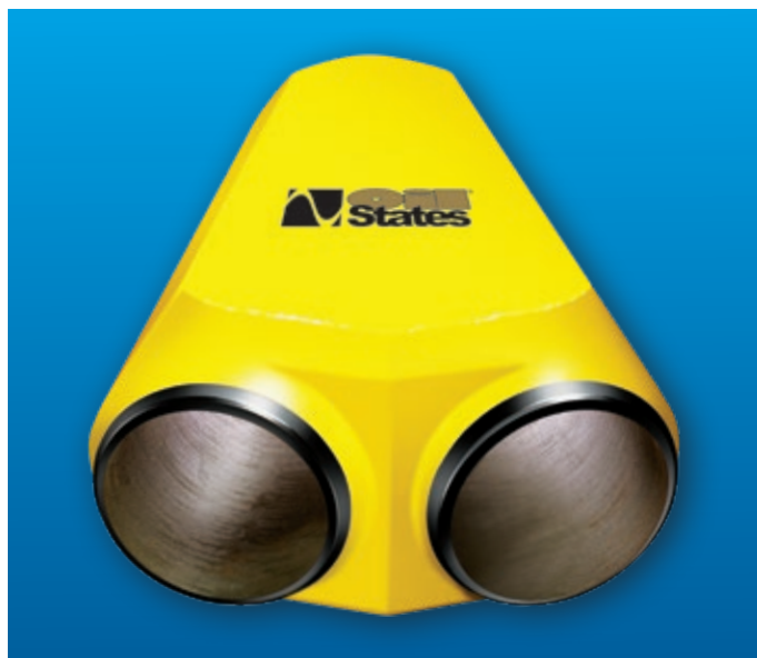
Piggable Wye: Symmetrical Design