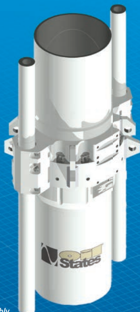
OR-6C Connector Assembly