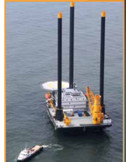
Nautilus Crane 7000L on the Montco Liftboat 'Robert'