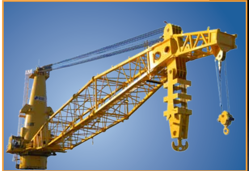
Nautilus® Marine Crane, Model 7000L

Oil States' Nautilus 7000L offers state-of-the-art features that represent the culmination of more than two years of engineering. The crane is equipped with a PLC control system with dual CPUs, offering a horsepower management system that matches load, speed and available horsepower across multiple function inputs. The system detects if one or more of the motors are at maximum power and makes hydraulic system adjustments accordingly to protect the motors.