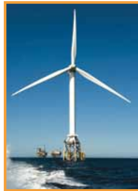
The 7000L is scaled and engineered for the offshore needs of tomorrow and beyond.