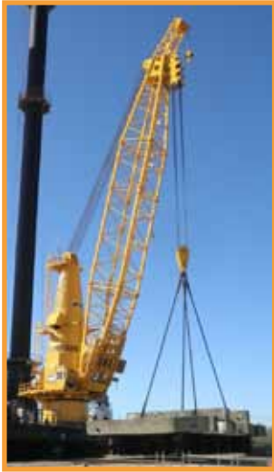
The Nautilus 500-ton model 7000L is sized and designed for today's demanding offshore lift vessels and loads.