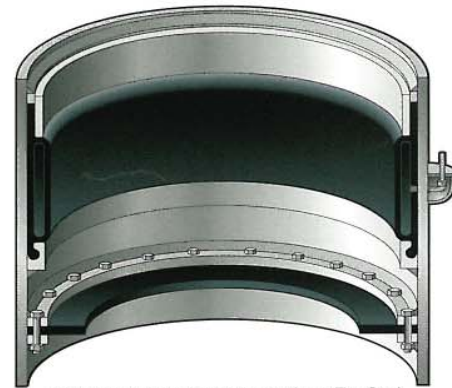
Inflatable Grout Packer with back-up Flat Seal

Oil States MCS is widely recognized for custom-designed grout packers for special applications. We have furnished packers up to 180 inches in diameter, packers that withstand inflation pressures up to 1400 psig, packers that accommodate cyclic inflation service, and packers that retain acceptable inflation pressure for as long as one year.