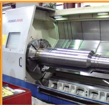
Puma 800L CNC Horizontal Lathe