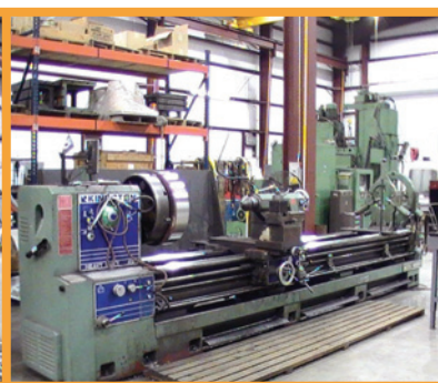
Kingston 40" Manual Lathe