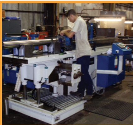
Nagel TBT Gun Drill