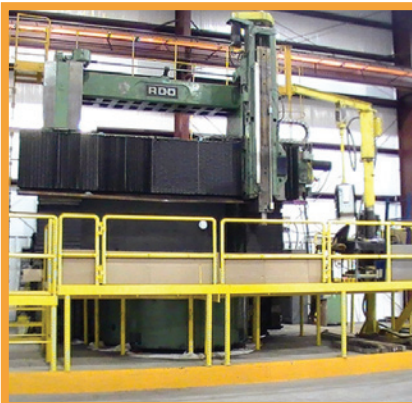
RD&D CNC Vertical Lathe