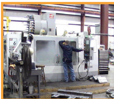
HAAS VF6 CNC Mill