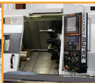
Mazak Quick Turn Nexus 350-II MY