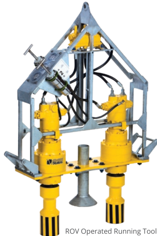
ROV Operated Running Tool