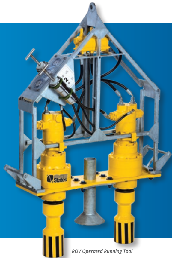
ROV Operated Running Tool