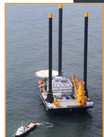
Nautilus Crane 7000L on the Montco Liftboat 'Robert'